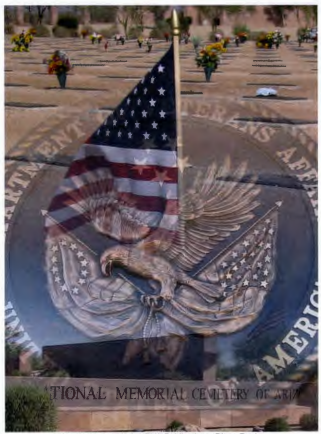
Used with permission PVA Publication - Diane Doyle