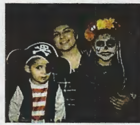
Costume Contest 2:30 Family Stage